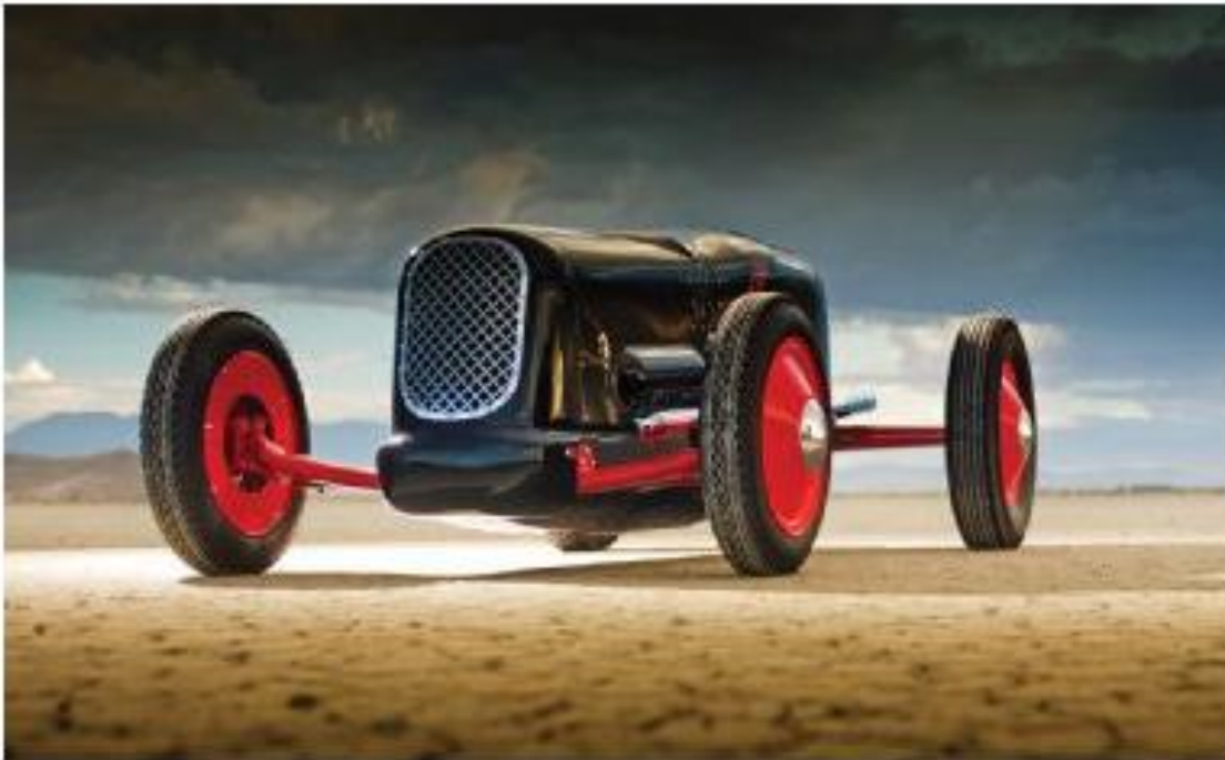
The Hilborn Modified c.1940

: officer's reports : : upcoming events : : bench racing : : on the drawing board :