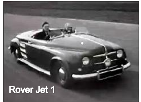
Rover Jet 1

When the gas turbine engine was born in the 1930's, it was envisioned for aeronautical use. After the end of WWII, there was a boom of turbine engine development, it was the engine of the future. Much like the early days of jet