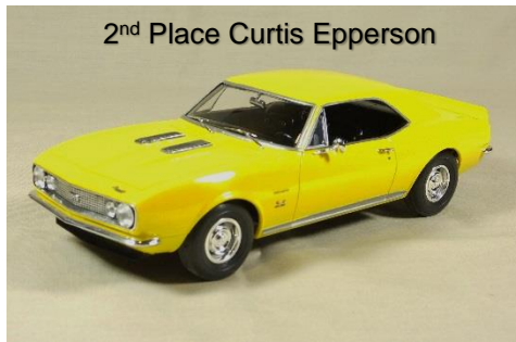
2 nd Place Curtis Epperson