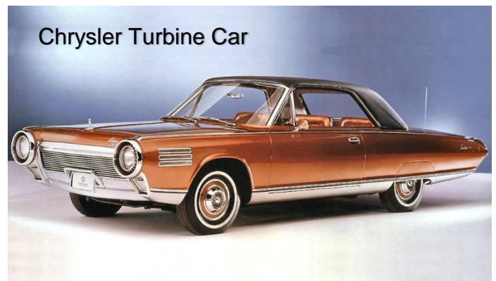
Chrysler Turbine Car

The gasoline powered piston engine has become reliable and thanks to computerized controls, very efficient. Pair it with an electric motor, the hybrid is even more efficient and it too has proved to be reliable.