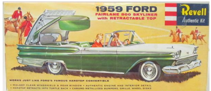
Original box art for the Revell '59 Ford