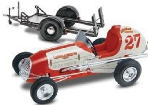
Eldebrock Equipped V8