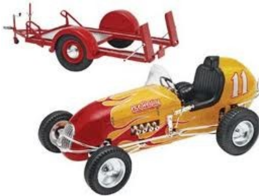
Powered by Offenhauser