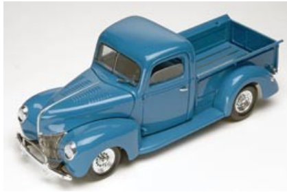
1940 Ford Custom P/U