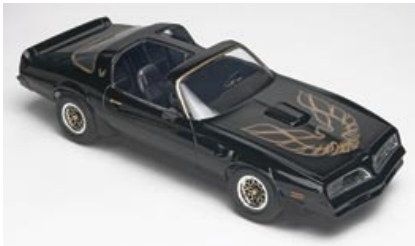
1978 Pontiac Firebird