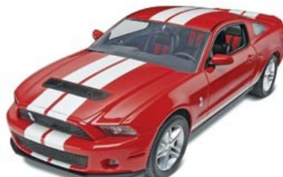
2010 Ford Shelby GT 500 1/25