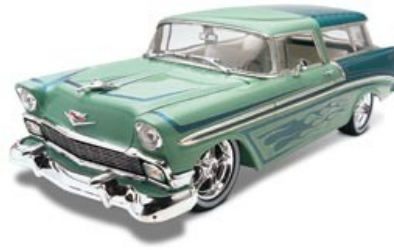
1956 Chevrolet Nomad