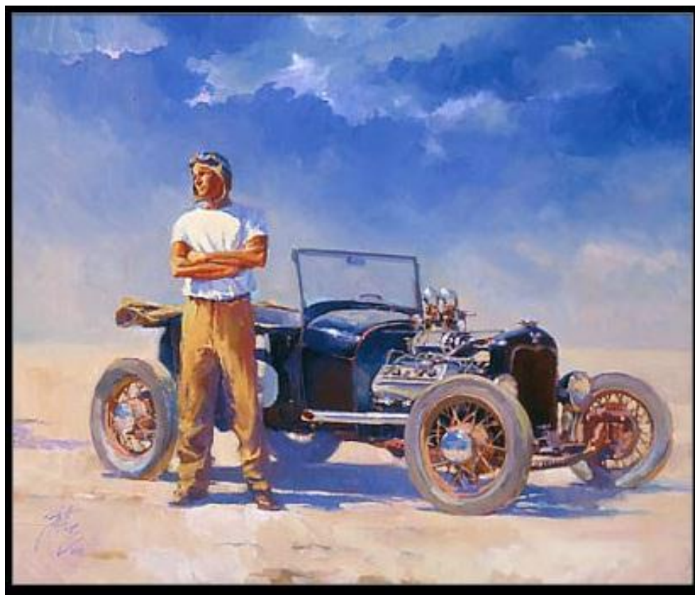
A very cool painting of an A-V8

: officer's reports : : upcoming events : : bench racing : : end-of-year list : : on the drawing board :